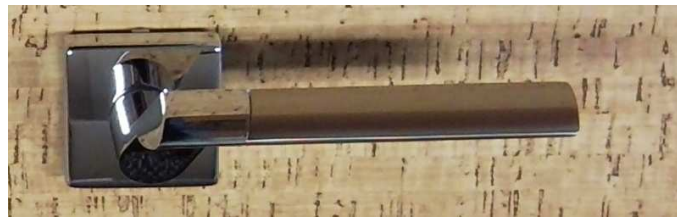
DAFNE-RQ86 NO (Z)