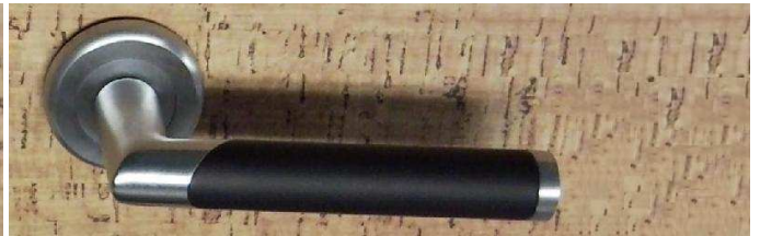
LAPIA-R006 RS (M)