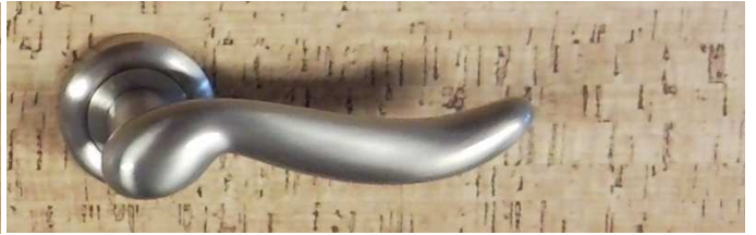
SIRENA-R103 NS (M)