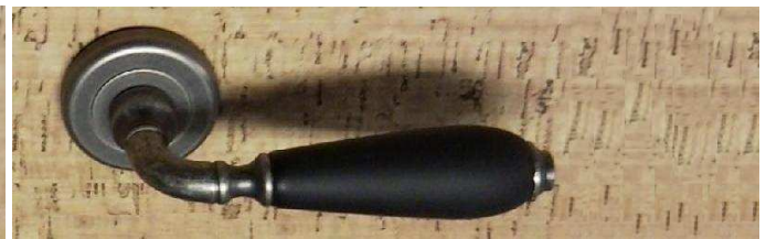
CINZIA-R006 NA (M)