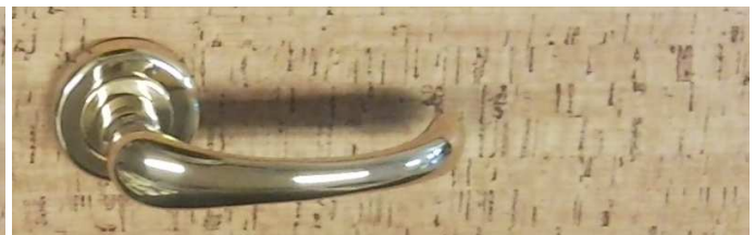
MOIRA-R006 LV (M)