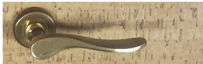
CLAUDIA-R006 BL (M)