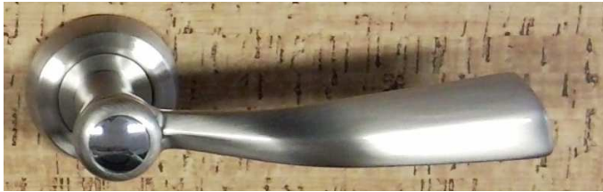
ELIKA-R108 NO (M)